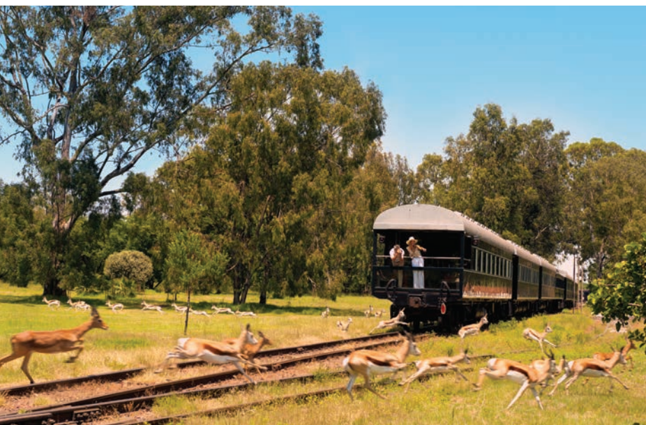
ROVOS RAIL, LUXURY TRAIN

EXPLORE SOUTHERN AFRICA ON BOARD A LUXURY TRAIN, THE ROVOS RAIL