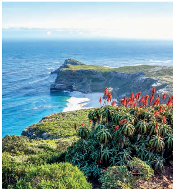
THE CAPE OF GOOD HOPE