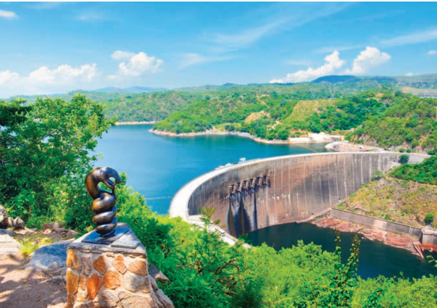
LAKE KARIBA DAM