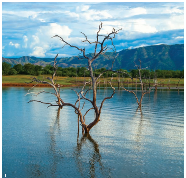
1. LAKE KARIBA

Our ships and lodges are available on both FIT & Charter basis.