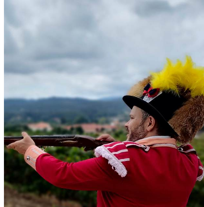
LOCATION Mata Nacional do Bussaco