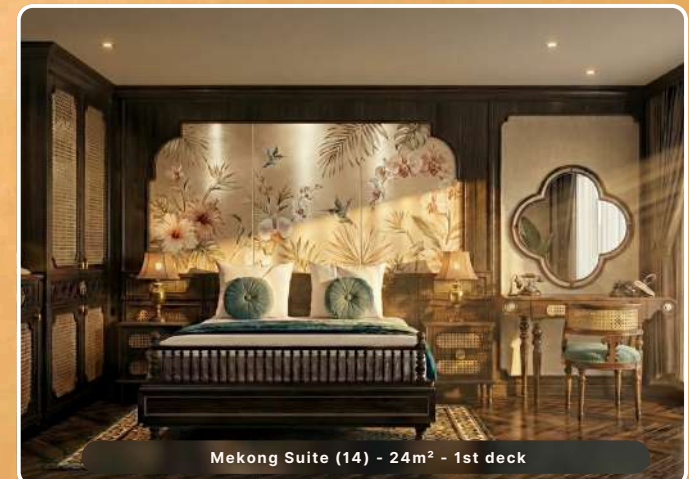
Mekong Suite (14) - 24m 2 - 1st deck