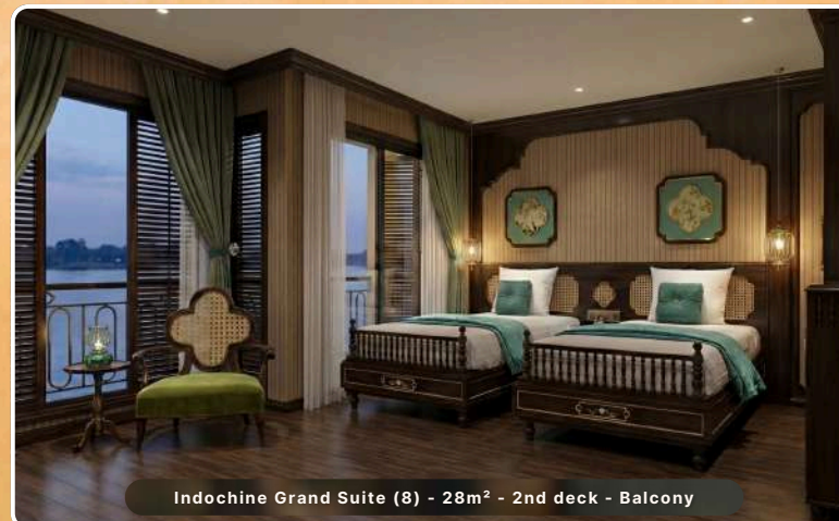
Indochine Grand Suite (8) - 28m 2 - 2nd deck - Balcony