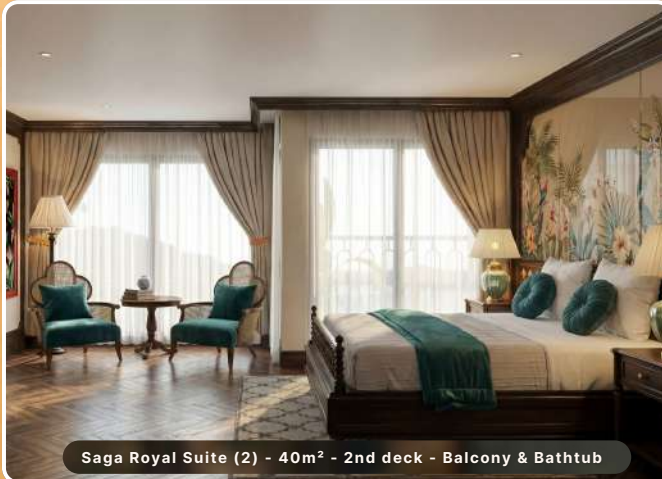
Saga Royal Suite (2) - 40m 2 - 2nd deck - Balcony & Bathtub

With just 24 cabins, including 10 with private balconies, Mekong Saga Cruise offers an intimate sanctuary where each room is a living artwork. Inspired by Champa, and Vietnamese heritage, every cabin glows with natural light and features handcrafted details made from the finest materials of the Mekong Delta. Expansive windows and luxurious bathrooms invite guests to immerse themselves in the serene beauty of the river in absolute comfort.